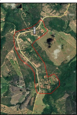
PLANTA DE LOCALIZAÇÃO